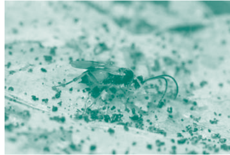
Cotesia plutellae parasitoid is sensing the odours coming from damaged leaf and larval faeces.

Chemically GLVs are mostly short-chained ketones, aldehydes, alcohols and esters. Many of these compounds induce strong behavioural response in females of parasitoid wasps, but also polyphagous predators show response.