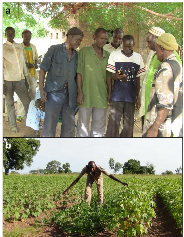
Figure 1. Farmers in the village of Touna, Mali, gather together to watch an agricultural learning video (a) and a cotton farmer points to the differences between the plot he fertilized using uniform application of compost, to the left, and the plot where compost was applied in pockets, to the right (b).

In recent years, third generation (3G) mobile phones, with video and Bluetooth capability, have become an important tool for communication in rural Africa [38, 39]. Rural Africa has experienced a particularly high uptake of information and communication technologies in the last 4 to 5 years [3] and the potential for short-term evolution of the used wireless communication technologies is predicted to advance at a fast pace in the next years [40]. Lawal-Adebowale [2] argues that mobile-phones are the most widely used IT device in Western African rural areas, with 62.9% of farmers in rural Nigeria owning such a device. Sousa et al [3] found that 92.5% of their sample of 400 farmers in Mali either owned, or had a family member who owned, a Bluetooth capable phone and all knew someone who possessed one, so had at least indirect access to 3G technology. Furthermore, Sousa et al. [3] found that Malians watch videos on mobile phones; mostly in groups and very frequently in public places of the village. These findings underline the potential of video use in 3G phones as a component of an agricultural extension strategy.