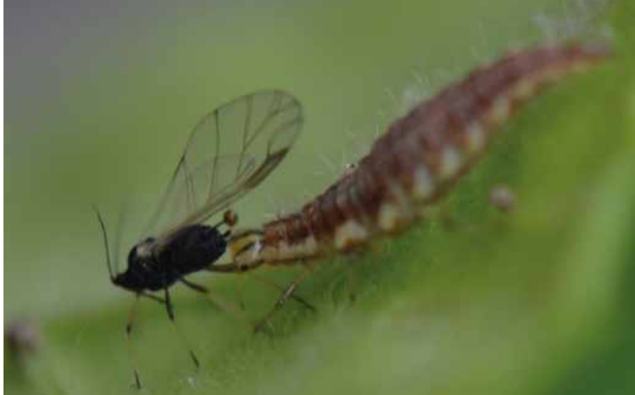
Larva of the lacewing fly that is feeding on aphid