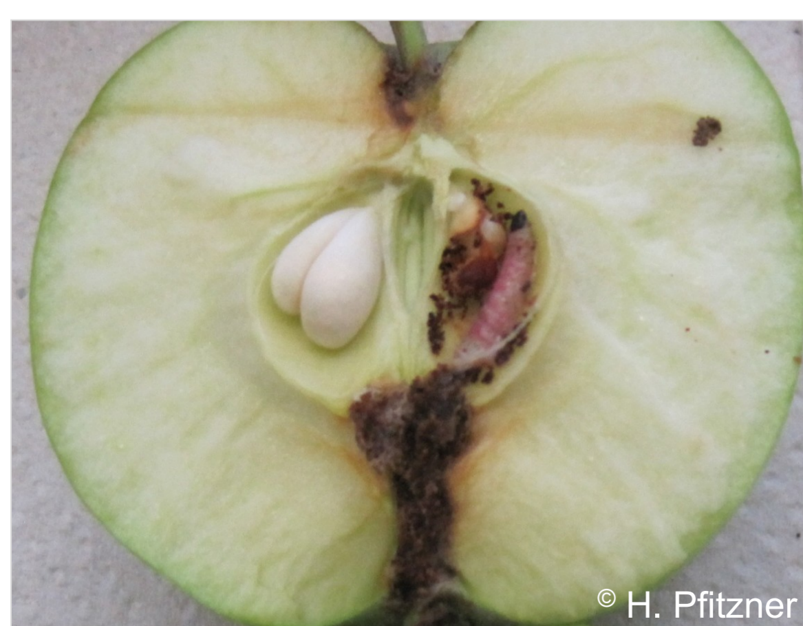
Fig. 7: Cydia pomonella , larva in apple.