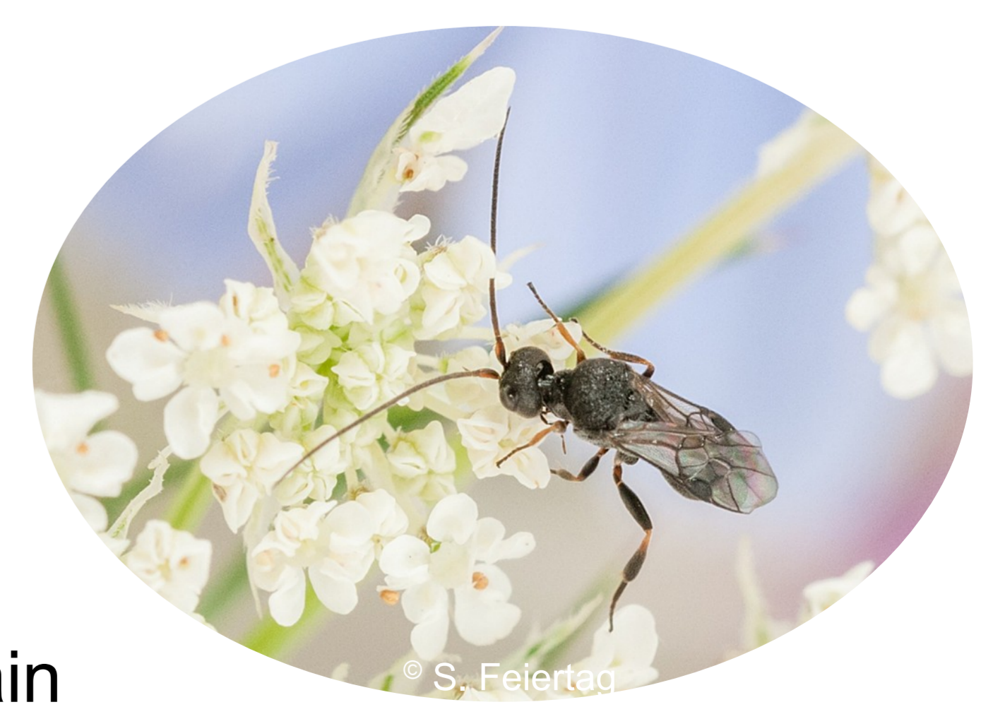
Fig. 11: Ascogaster quadridentata on Daucus carota .