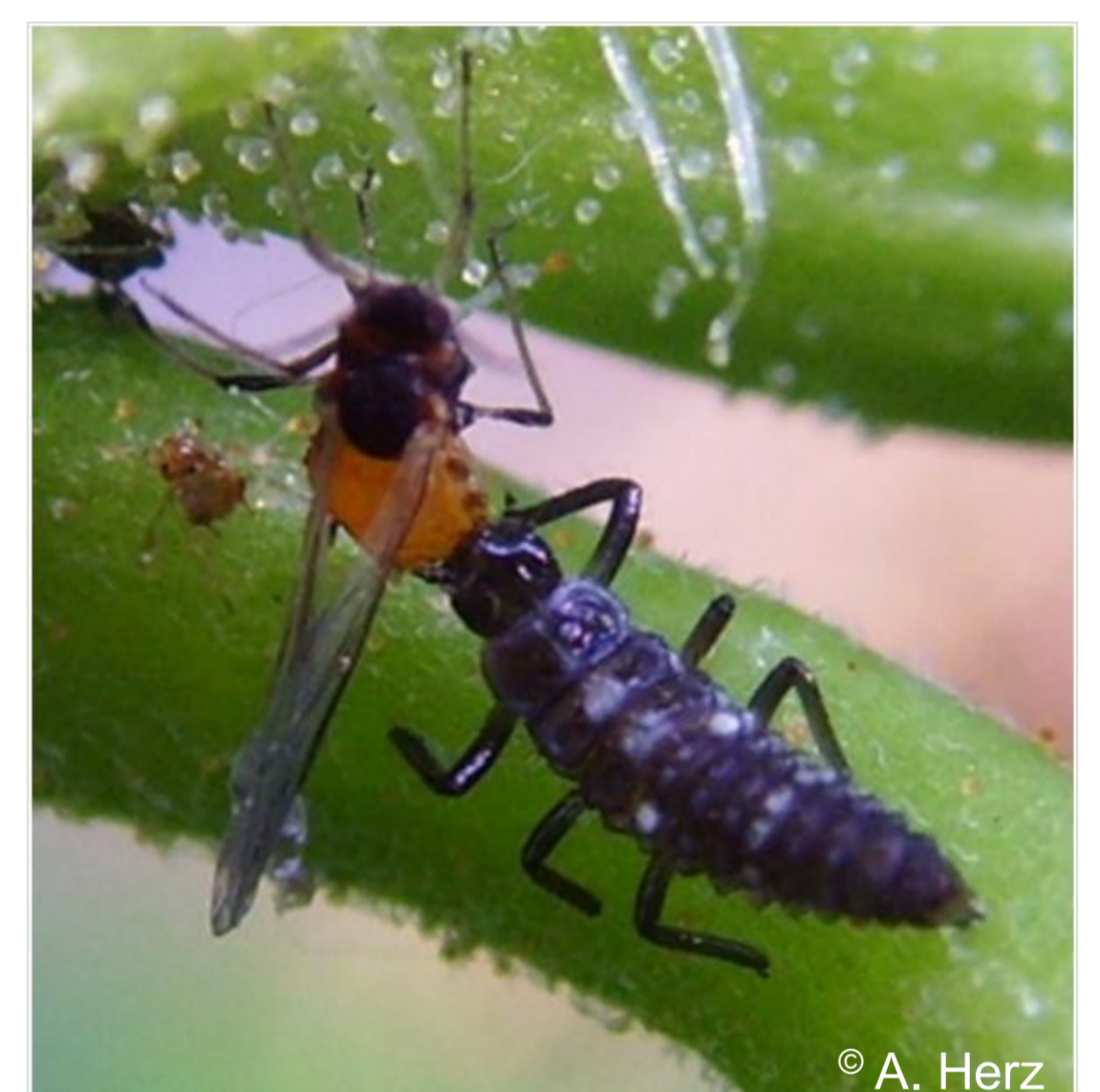
Fig. 9: Larva of Coccinellidae at work.