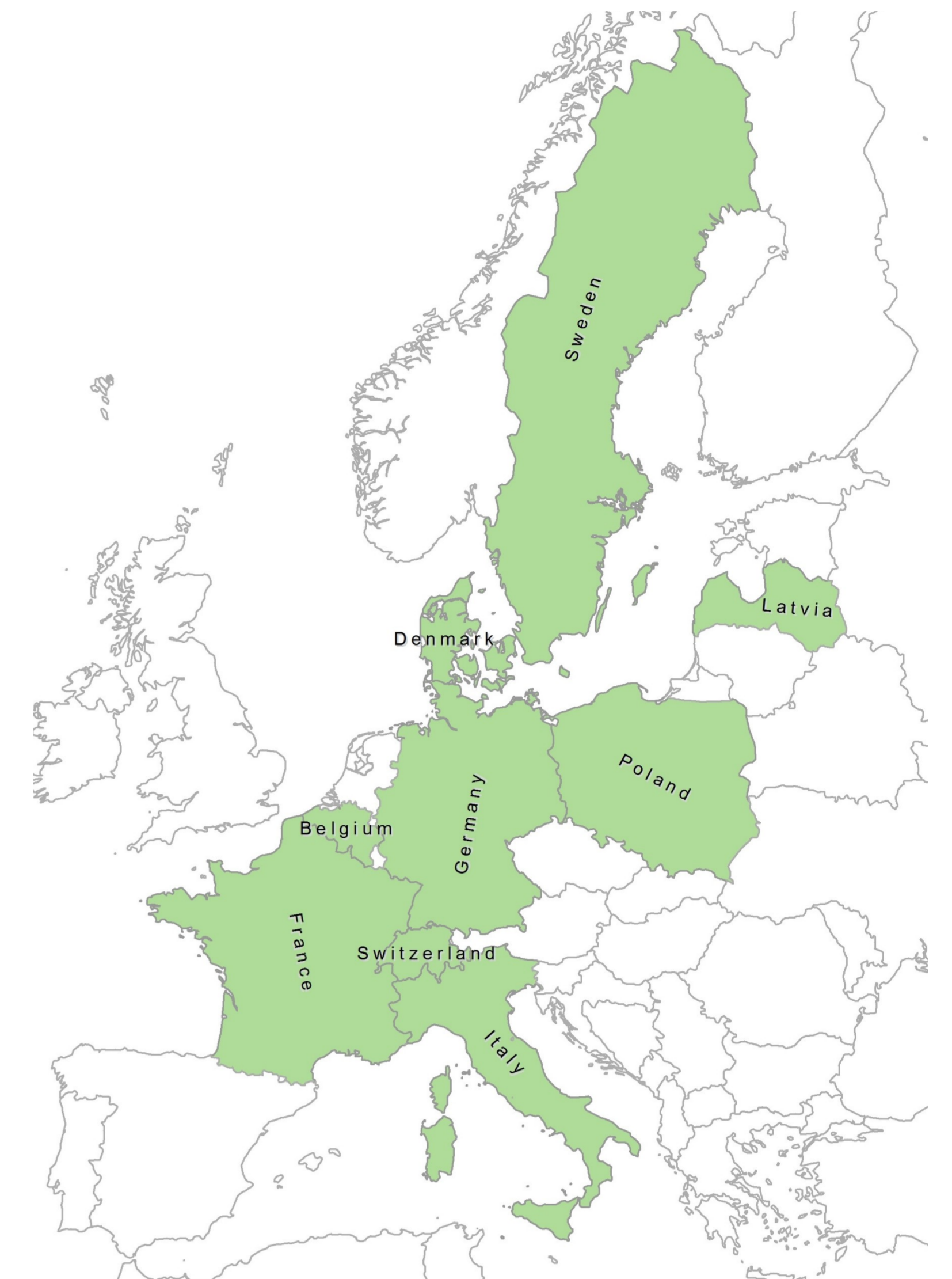
Fig. 1: Contributing countries, Map: ArcGIS

Universities, research institutes, advisory services and collaborating farmers of nine European countries (Figure 1). This project is funded by the COREorganic Plus Program of the EU and national funding bodies for three years (2015 - 2017).