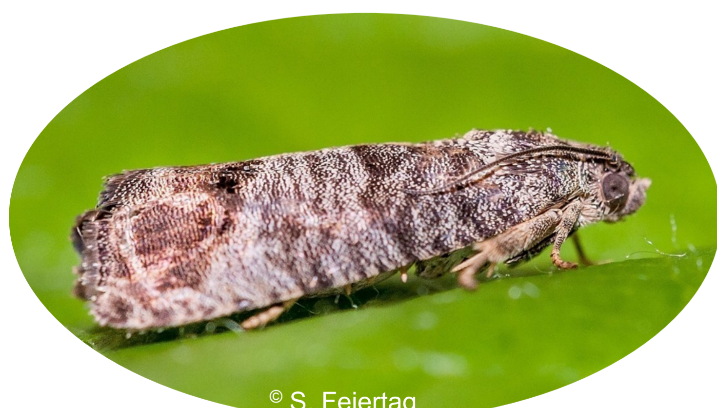
Fig. 6: Cydia pomonella