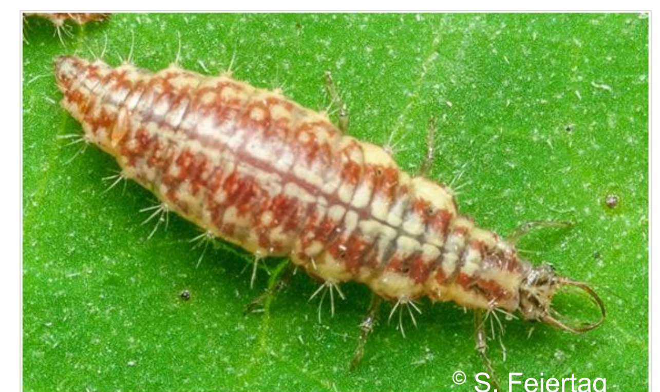
Fig. 10: Larva of Chrysoperla carnea