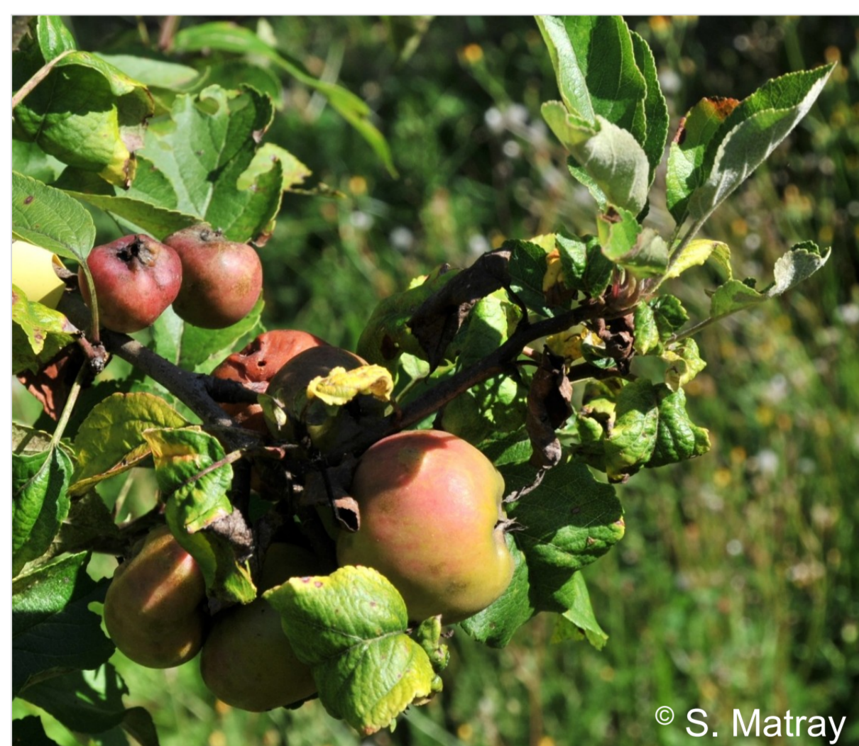
Fig. 5: D. plantaginea damage on leaves and apples.