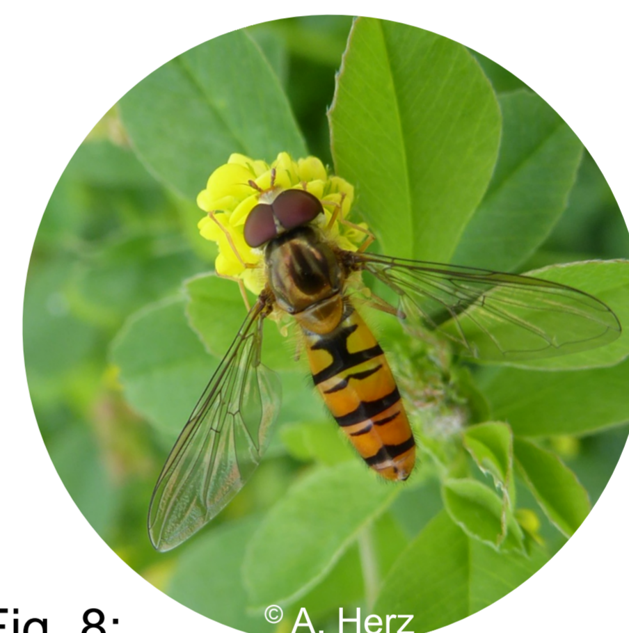
Fig. 8: Episyrphus balteatus on Medicago lupulina .