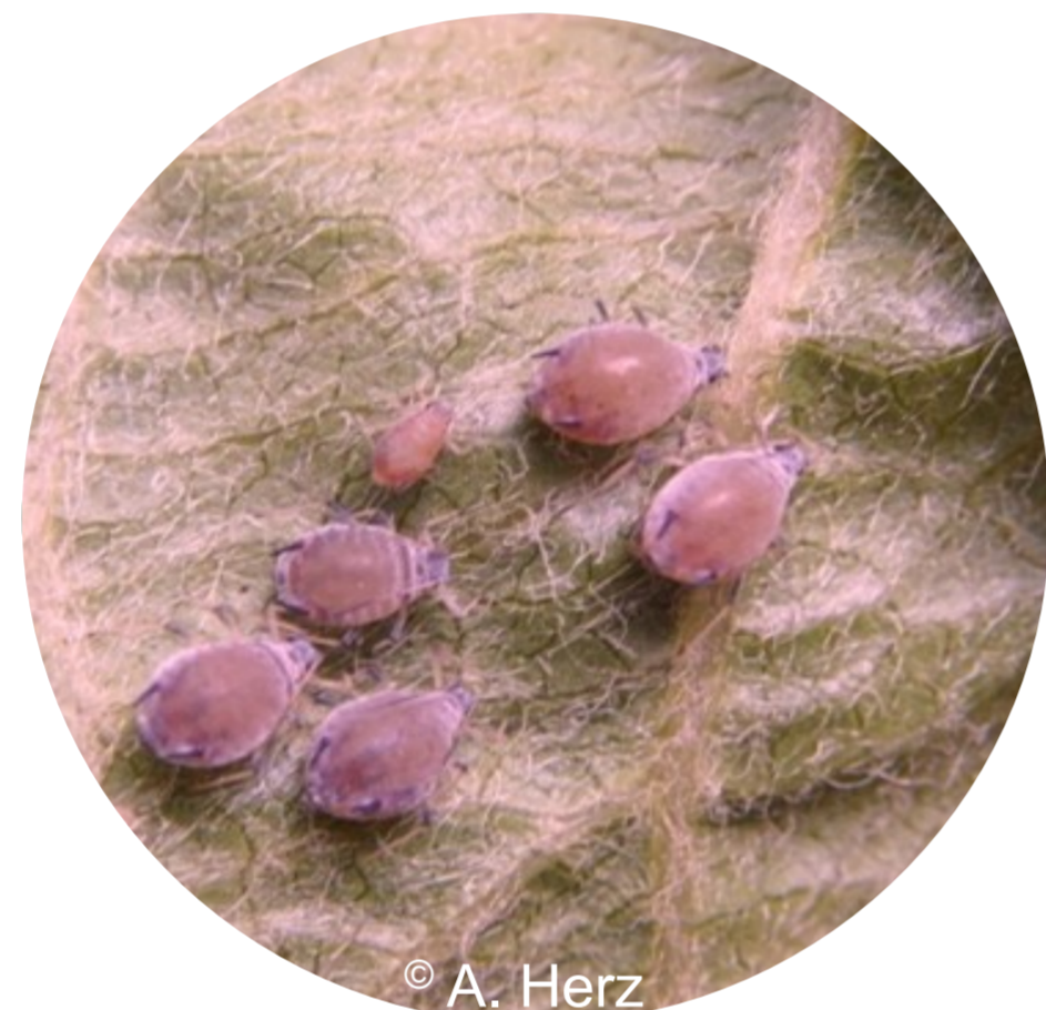
Fig. 4: Dysaphis plantaginea