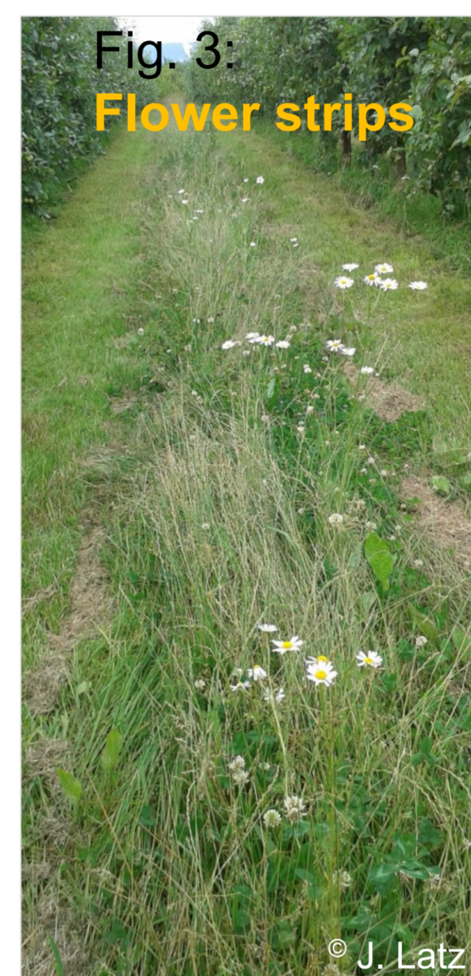
Fig. 3: Flower strips