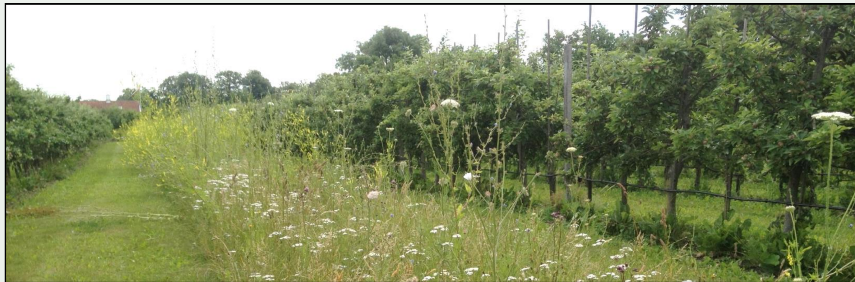
Fig. 2: Flower strips in the interrows of apple trees. Pest and predator assessments are compared between plots with and without flower strips.