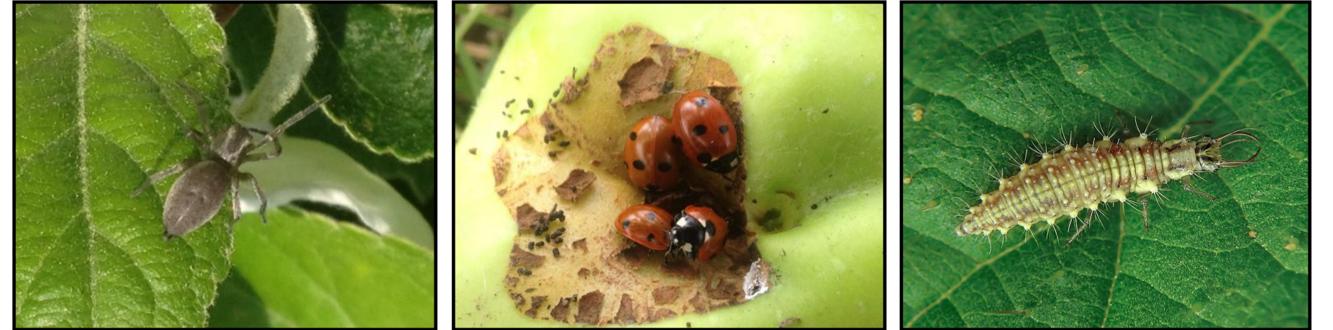
Spiders, ladybird bugs and Chrysoperla larva are among the many naturally occurring predators in apple orchards