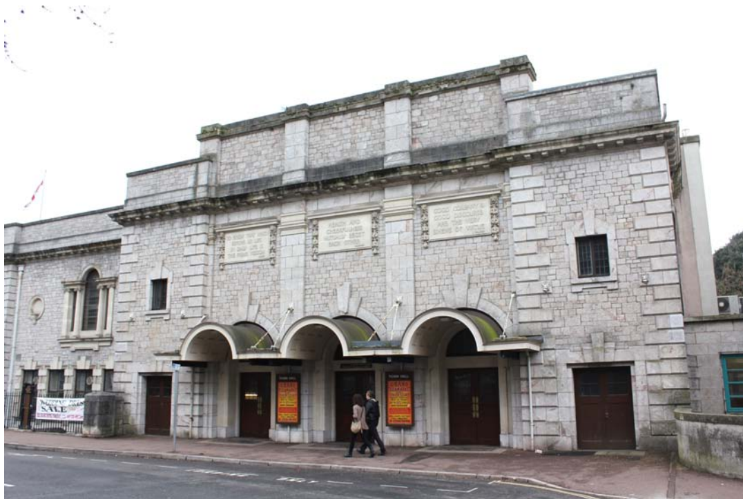
Torquay Town Hall, exterior.

“The performances and lectures took place in an ugly, tasteless building ... What was chiefly available was a single big hall. Everything was inside it: rehearsals, lectures, bookstall, discussions! Everything disrupted everything else! The rehearsals were noisy, as the bookstall had to be kept open and people were going in and out ... During the eurhythmy performances half the audience went for a swim, as performances had been arranged at the best swimming time! Everything was difficult!”(1965, in Villeneuve, 2004, p.1057).