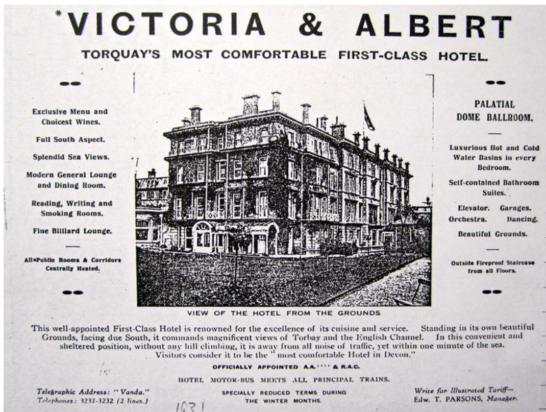
Advertisement for the Victoria and Albert Hotel (1931).