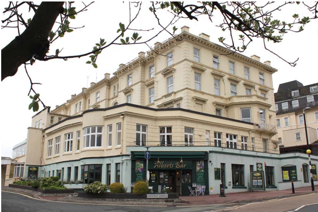
Victoria & Albert Hotel, Torquay, exterior.

As Steiner observed at Torquay: "Many things that might still have been said will have to be saved up for some future time" (22 August 1924, Torquay, in Steiner, 1998, p.283).