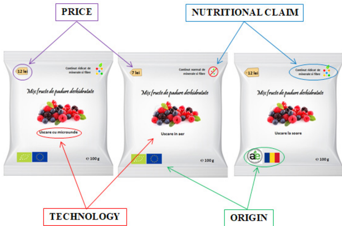
Figure 2. Product attributes used in the conjoint analysis design in the form of conceptual cards

4 conjoint attributes: price (2 levels), origin (2 levels – EU and RO), content of minerals and fibers (2 levels - normal content and higher content of minerals and fibers), and processing technology (3 levels - air drying, sun drying and microwave drying).