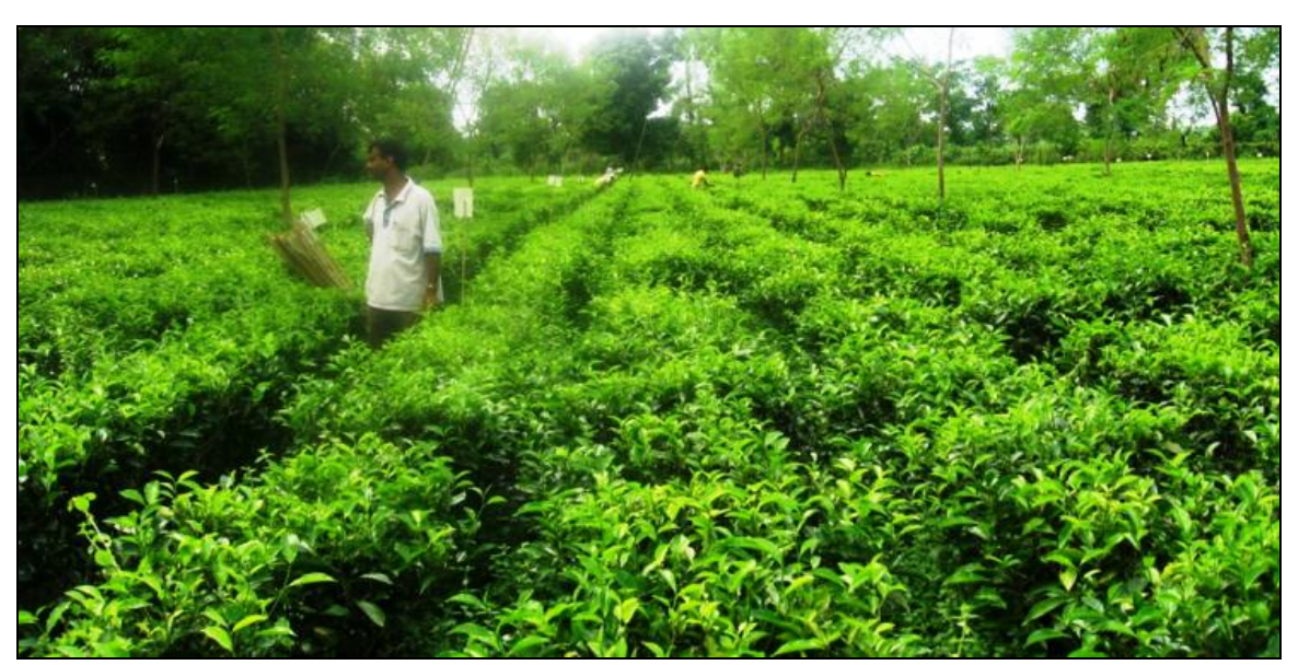
Fig. 1: Organic Young Tea Management at Maud Tea Estate, Assam, India.

effectiveness under new plantation experiment. Experiment was laid out as per randomized block design (RBD) with eight treatments and three replications (Figure 2). Effectiveness of the different packages was evaluated in terms of yield achieved over control, year wise yield progression towards meeting the target and finally economic viability.