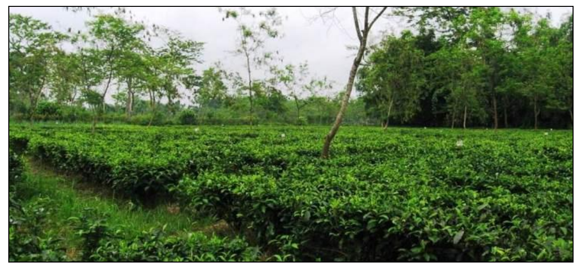
Fig. 4: View of Young Tea Plantation Selected for Experiment under FAO-CFC-TBI Project at Maud T.E., Assam.

Note: Quantity of soil inputs under different POP were calculated on plant—N requirement basis i.e. for giving 60kg N, except for the soil inputs which had fixed recommended dosage like BF, BD and FYM-2. Actual dosage was calculated based on N and moisture percent in the soil input. Novcom compost was applied in combination with 40 kg Elemental-S and 80 kg Rock phosphate per hectare. In case of soil mgt. using Biodynamic compost, CPP @ 12.5 kg/ ha and Cow horn manure (15 ltr. soln/ ha) was also used. Pruning: UP - FFP - UP; Bush Population: 7065/ha; Age: 3 - 5 years; VCR was calculated considering Made tea @ Rs. 200/ kg.