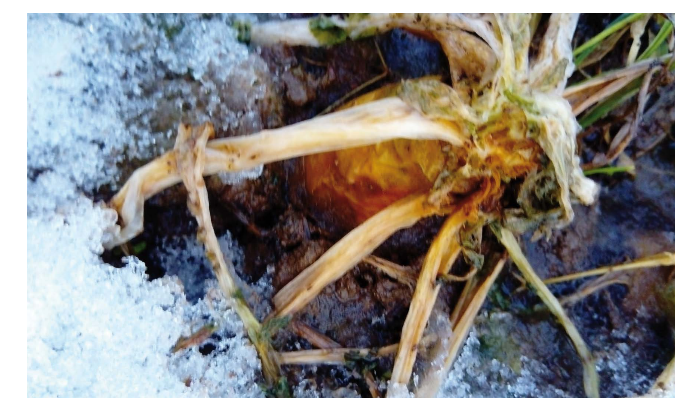
Figure 5. Tillage radish in autumn and winter