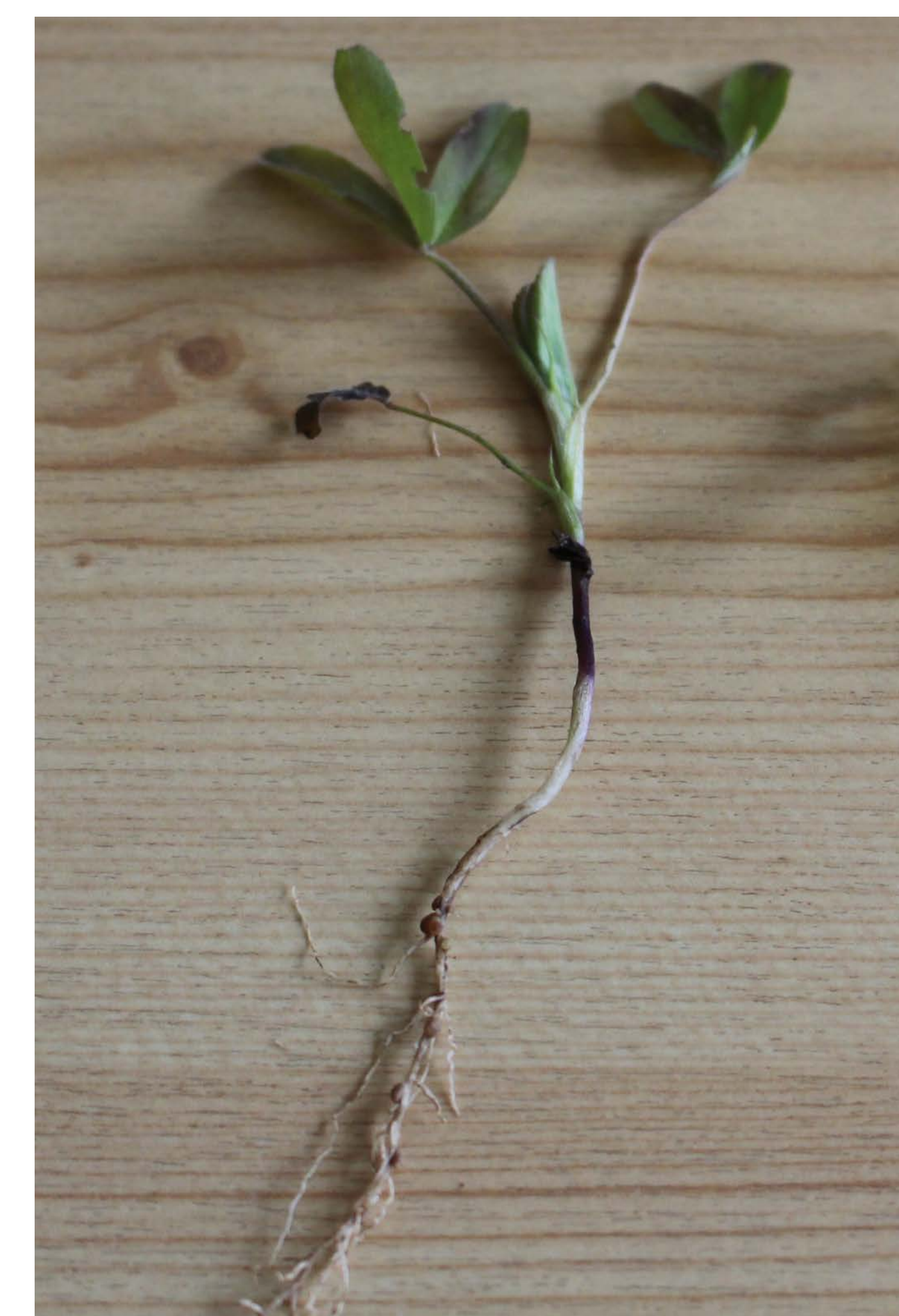
Figure 4. Berseem clover in 2016 and 2015