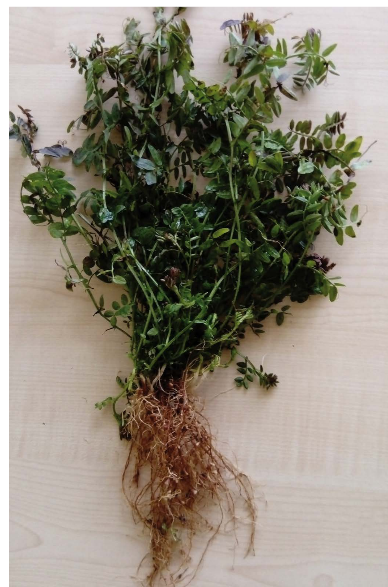
Figure 3. Hairy vetch in spring