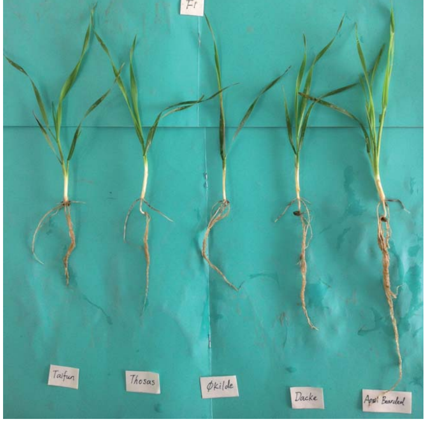
Differences in early root growth vigor in spring

Organic farming systems rely on the efficient use and recycling of available resources. Currently, some mineral nutrients like phosphorus are used only once to produce food. Subsequently, they are lost due to poor recycling of organic wastes back to farmland. Simultaneously, P balances calculated for organic farming indicate that often more P is removed with the products than applied as fertilizer. Consequently, this leads to decreasing amounts of plant available soil P. There is an urgent need to improve the recycling of P from urban areas and the food industry, back to cropland.