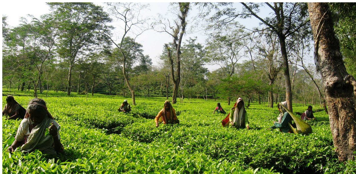
Pic 1 : Landscape view of West Jalinga Tea Estate, Assam, India

Experimental site: Available green matter comprising of various garden weeds were composted aerobically by Novcom composting method at W. Jalinga Tea Estate i.e. a certified organic tea garden in Cachar (Assam, India). Compost samples were drawn from 36 batches of compost produced during 2006-2007 to 2012-2013. 60 surface soil samples were collected from different sections of the plantation before application of Novcom compost in the month of December and then again in 2013 i.e. post seven years of Novcom compost application at the rate of 3 ton/ ha/ year. Soil and compost samples were air dried and sieved. Soil samples were analyzed for physicochemical properties, fertility and microbial status while compost samples were tested for physicochemical properties, nutrient content, microbial properties, stability, maturity and phytotoxicity status.