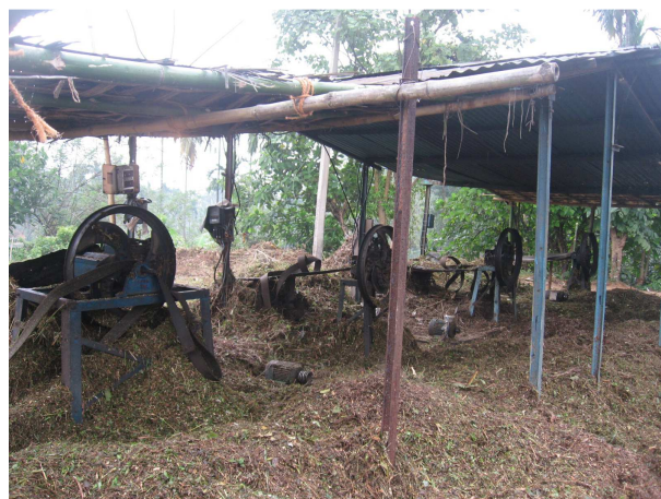
Pic 2 : Shredding of green matter for composting at W. Jalinga T. E.