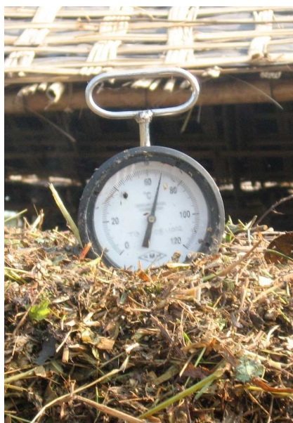
Pic 9: Monitoring of temperature of Novcom compost heap at W. Jalinga T. E.

Novcom compost appeared dark brown in colour with a characteristic earthy smell, which are often deemed necessary for mature compost [15]. Average moisture varied from 45.23 to 64.30 percent, which may be placed under high value range (40 to 50) as per the rating of [16]. Bulk density of the samples (0.52 to 0.78 g/cc), were in accordance with the standard range (0.4 to 0.7 g/cc) as suggested by the U.S Composting Council (2002) [17] while porosity ranged from 48.0 to 69.0 percent (Table 1). Water holding capacity of 112 to 148 percent, represented the high value range (standard range of 100 to 200 with preferred value of >100) as per the rating of [16]. Water holding capacity may be attributed to the abundance of humus particles in compost [8] and the addition of such compost in soil helped in retaining soil moisture during dry months [18].