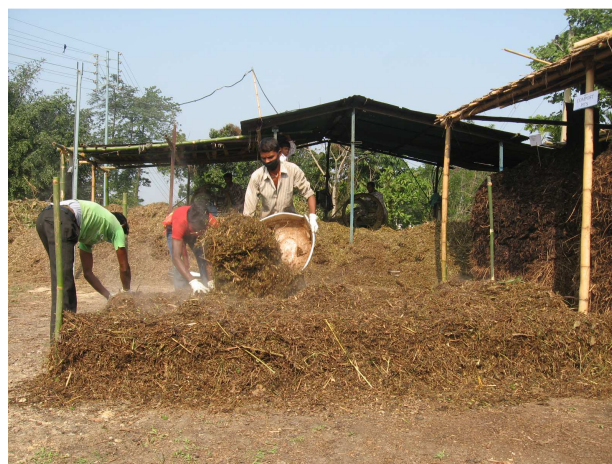
Pic 3 : Initiation of Novcom compost heap with chopped green matter.