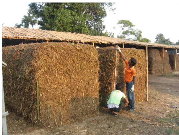
Pic 7 : Complete Novcom compost heap (10 ft x 8ft x 6ft) at W. Jalinga T. E.