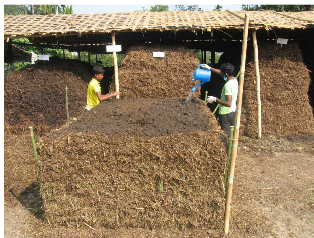
Pic 6 : On going Novcom compost heap with green matter & cowdung at W. Jalinga T. E.

Day 22 : The composting process was complete and Novcom compost was ready for use.