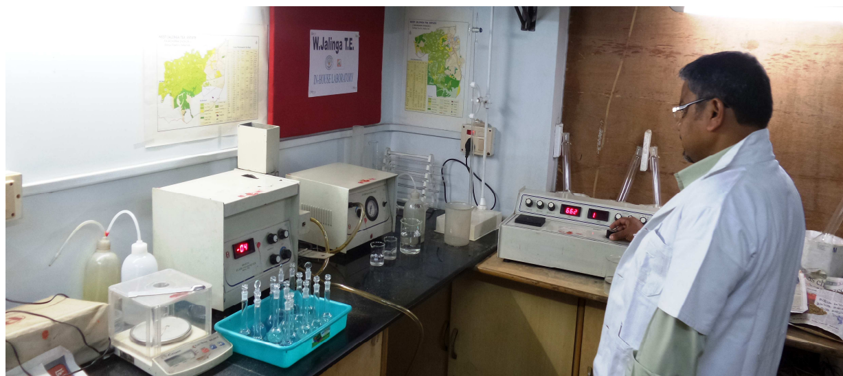
Pic 11 : Analysis of soil quality at in-house laboratory of West Jalinga T. E., Assam, India.