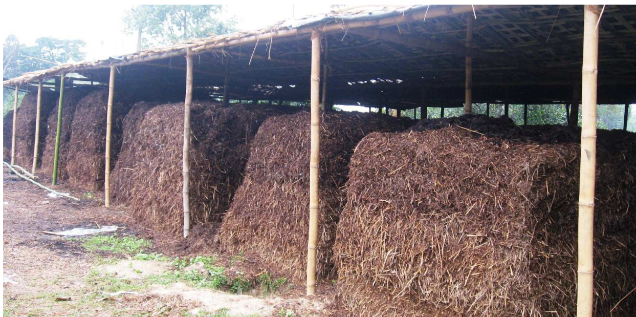
Pic 8: Novcom composting shed at W. Jalinga Tea Estate, Asam, India.