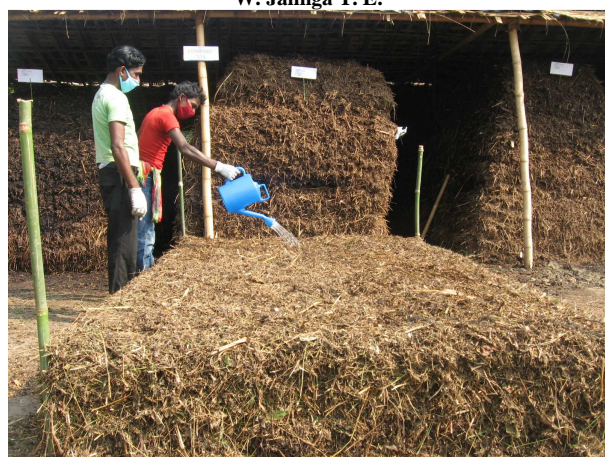
Pic 4 : Spraying of Novcom solution (5ml/ltr of water) on green matter layer.