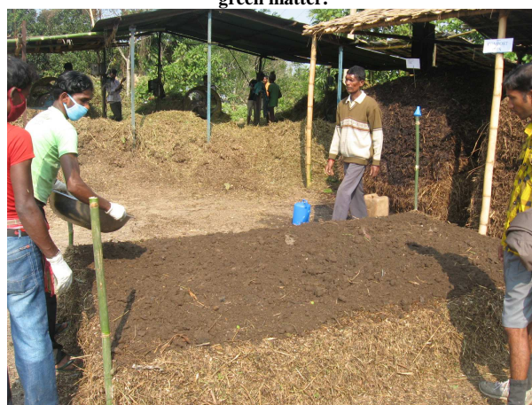
Pic 5 : Application of raw cowdung top of the green matter layer.

In the Novcom composting process the high temperature of 65-70 0 C pasteurizes and kills pathogens. At the same time thermophilic bacteria and actinomycetes are produced while proliferation of mineralizing bacteria is prevented and thereby loss of valuable substances is restricted. The first stage of decomposition henceforth prepares the field for fungi. After a period of 12-14 days from initiation, the temperature falls. At this stage manure worms chew organic matter and enables its breakdown as well as multiplication of fungi takes place. This is followed by the last and the final segment where cellulose and lignin components are acted upon by the fungal population. Lignin, a complex polymer of phenyl-propane units can only be broken-down by the necessary enzymes produced by certain fungi and the most scientific process is to attain such degradation only at the last stage of the decomposition process. This stage if tried to prepone unnecessarily by adding any microbial culture or any agent hinders the bio-availability of other constituents by reducing the surface area available for enzymatic penetration and activity. The degradation process continues further for a period of 7-8 days after which the final matured compost is ready for use within 21 days of initiation.