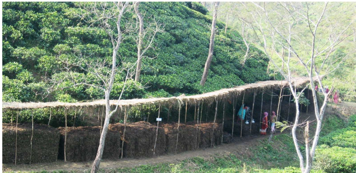
Pic 10: Novcom composting heaps within the plantation at W. Jalinga T. E, Assam, India.

0.88 and 1.38 (mean 1.13), once again being well above the highest order of rating (1.0). The high value not only indicated absence of phytotoxicity [45] in compost samples but also confirmed the potential of Novcom compost towards improving germination and radical growth [8].