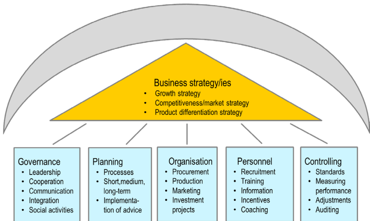
Figure 1: Overarching business logic with business strategies, management areas and instruments

A variety of approaches for strategy analyses are available in the literature. Figure 1 highlights three groups of strategies: growth strategies, competitiveness or market strategies and product or product line related strategies.