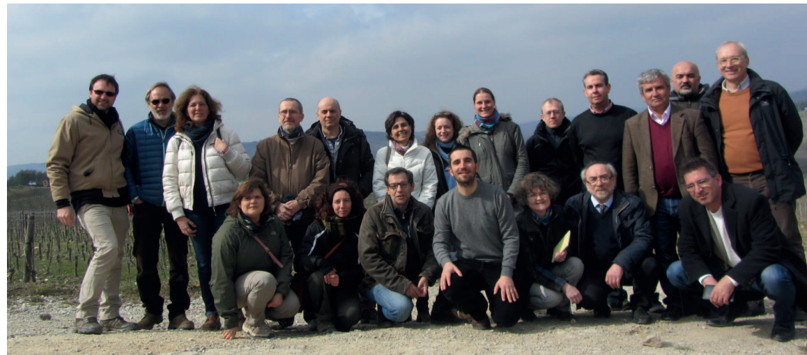
ReSolVe group at the kick off meeting in March 2015