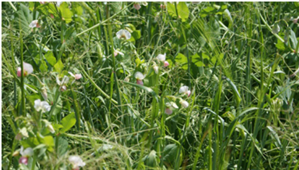
Crop species mixture of pea and spring barley.

Crop species mixtures, such as cereals + grain legumes, and variety mixtures of cereal species change the growth rate and architecture of crop canopies. Noxious weed species can be better suppressed as compared to sole crops or varieties but without eradicating more beneficial weed species that host organism antagonistic to pests.