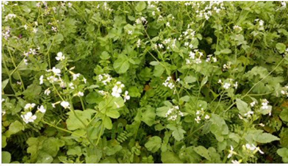
Suppressive cover crop with winter vetch and fodder radish.

Cover crops add further diversity to cropping systems mainly in the periods between main crops. Pertinent choices of cover crops species can suppress the growth of serious perennials.