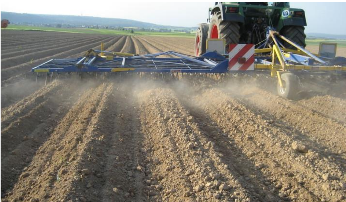
Figure 2: Precision flex tine harrow (Treffler)

In livestock-based arable systems, annual weeds are relatively easy to control by appropriate mowing regimes of the ley. Cutting grass-clover or similar leys usually break the life cycle of annual weeds before they are able to form seeds, determining their decline over the whole crop rotation. On top of this, use of flex tine harrows like the Treffler one would result in improved annual weed control in both the ley and annual crop phases of the rotation (Huiting et al., 2014).