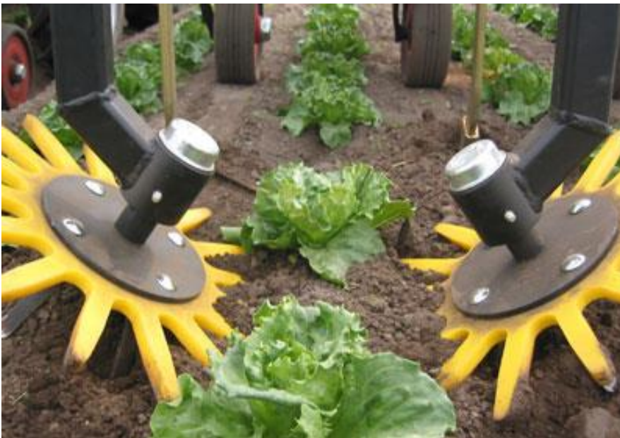
Figure 3: Finger weeder in action 2

In stockless arable systems improved control of annual weeds may come from more targeted use of species and/or varieties in either single stands (Drews et al. 2002), cover crops or intercrops. Varietal or species mixtures may increase weed suppression and simultaneously enhance the array of genotypes with the right traits available for the different environments. More fine-tuned tools for mechanical termination of cover