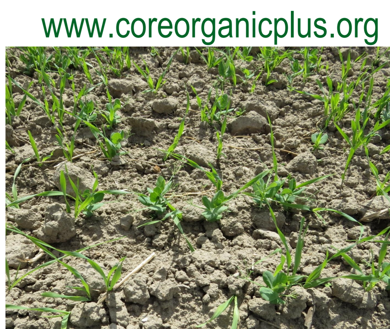
Grain-pea crop mixture.