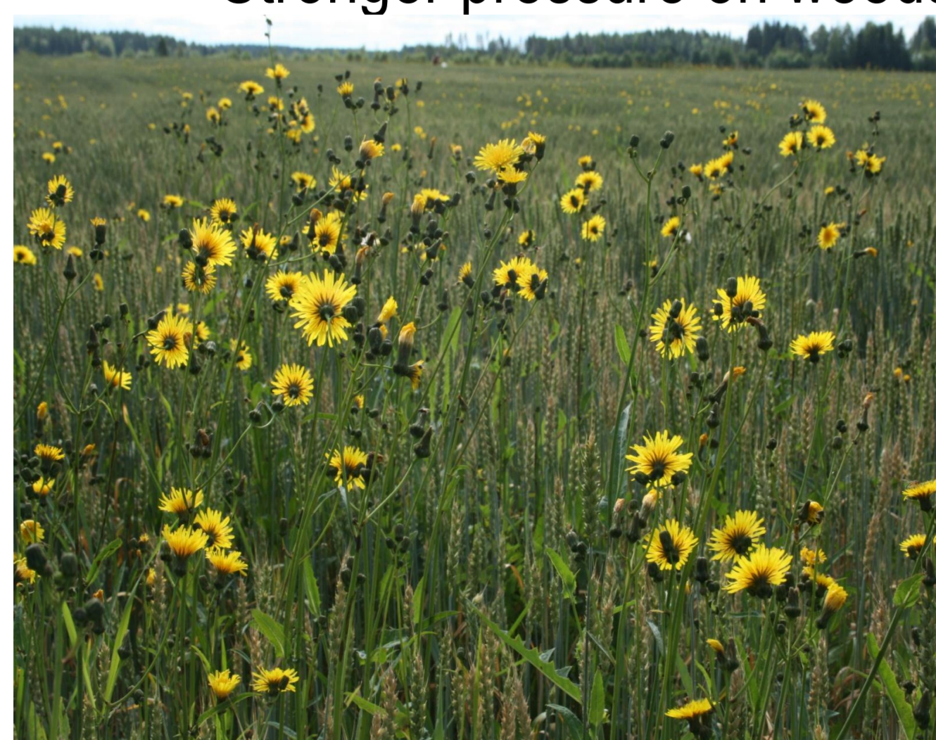
Sonchus arvensis ; a problematic perennial weed.