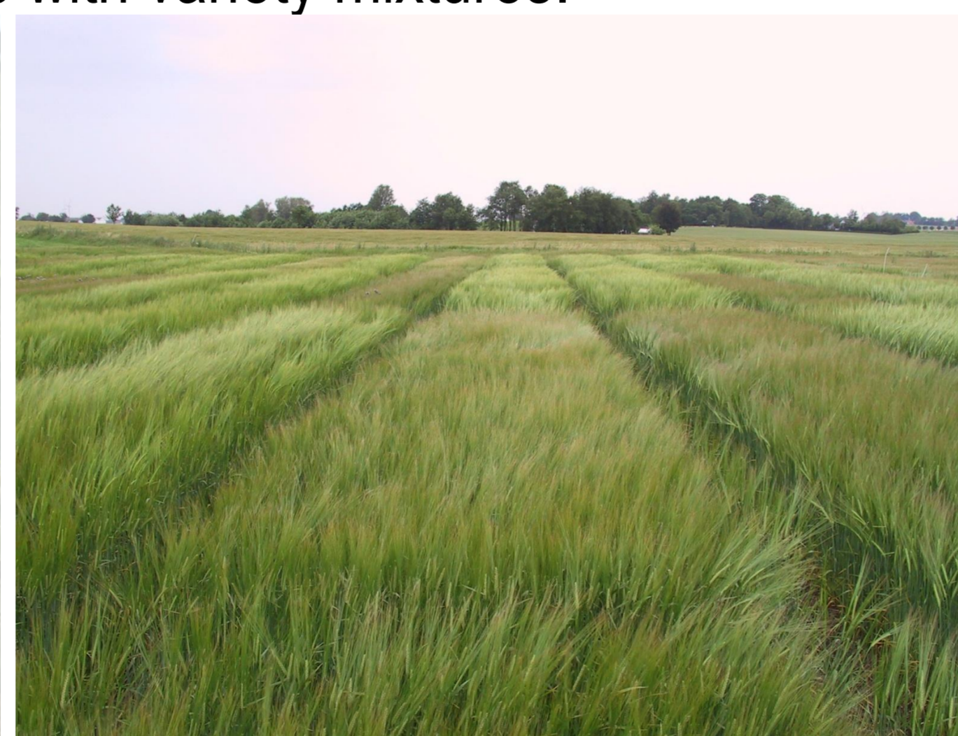
Weed suppressive ability of different spring barley varieties.