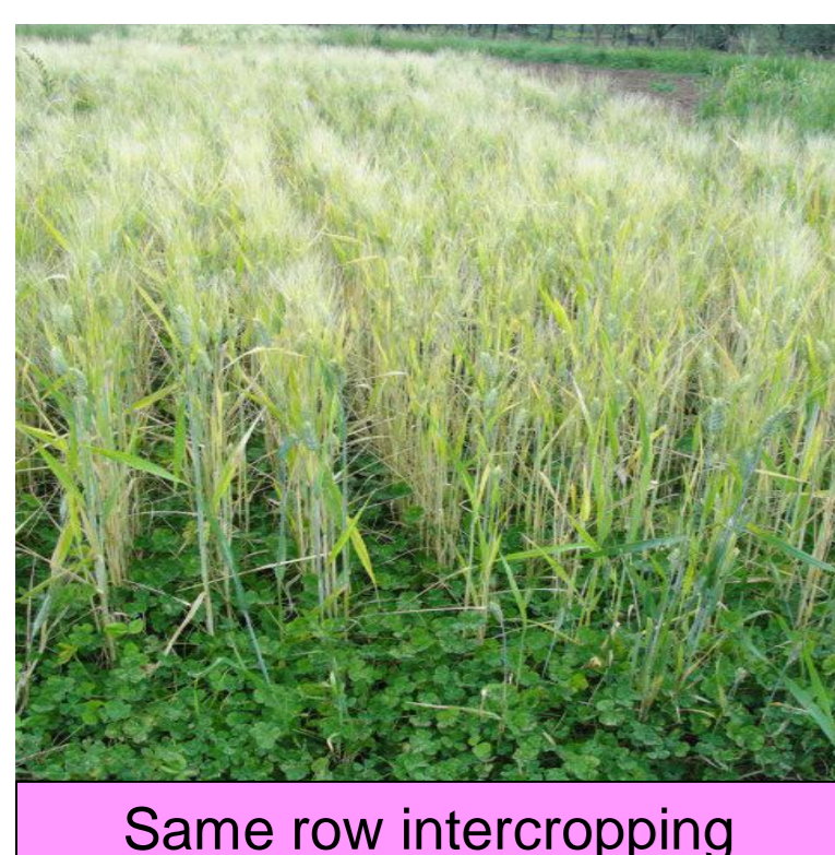
Same row intercropping