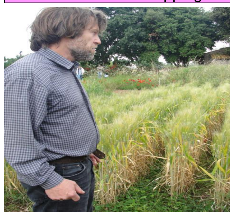
Wide row intercropping