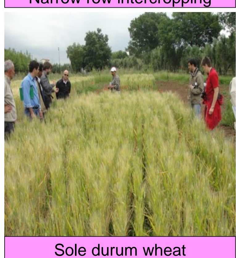
Sole durum wheat