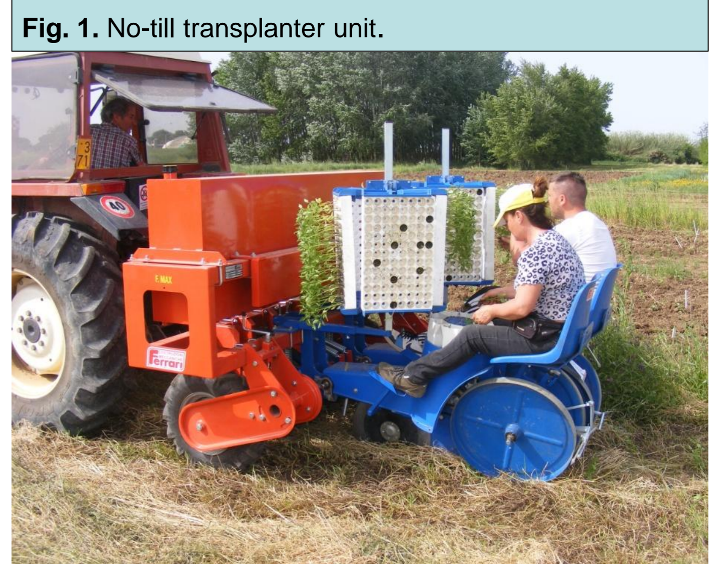
Fig. 1. No-till transplanter unit.

The front disc (Fig. 2) slices the organic mulch, thus loosening the soil without inverting or incorporating the residues. The double-disc openers cut the soil, in the trench created by the front disc, in order to facilitate the formation of the furrow and create a suitable environment for seedling placement (Fig. 3). A carousel mechanism was maintained for seedling placement (Fig. 4). The original closing wheels, generally used for directing and compacting the soil in conventional tillage systems were adapted since it was necessary to increase down pressure in order to close the slits created in the organic mulch and in the soil by the discs (Fig. 5).