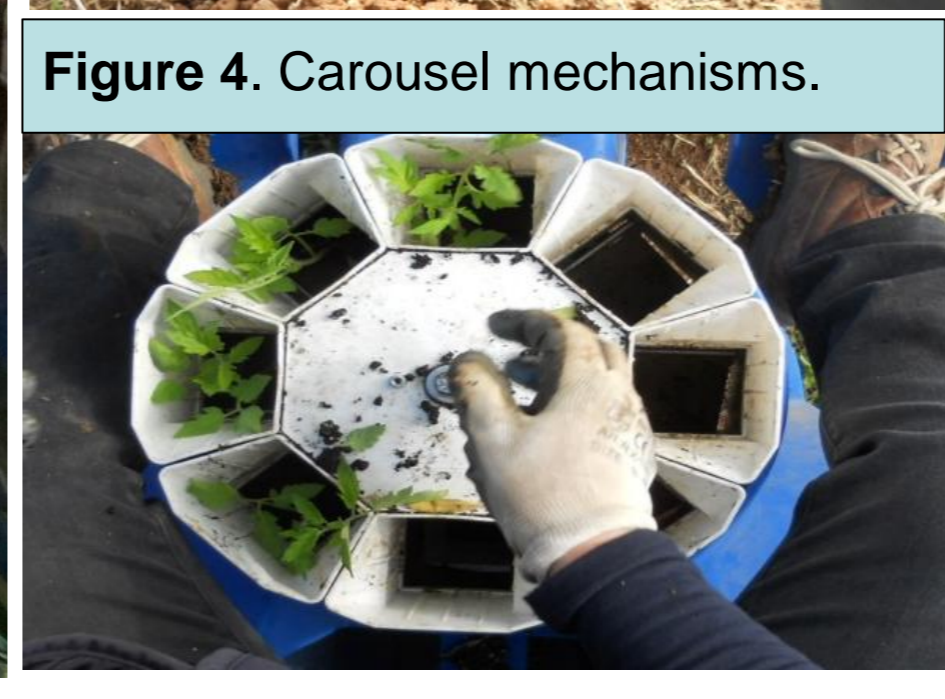
Figure 4. Carousel mechanisms.