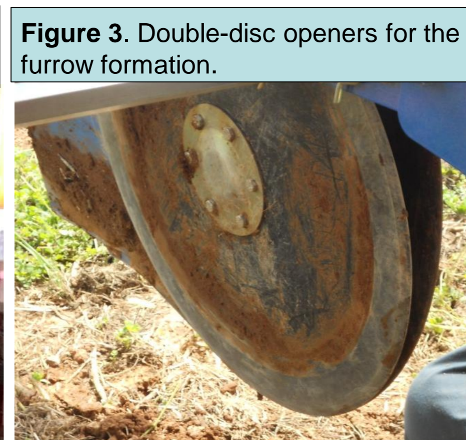
Figure 3. Double-disc openers for the furrow formation.