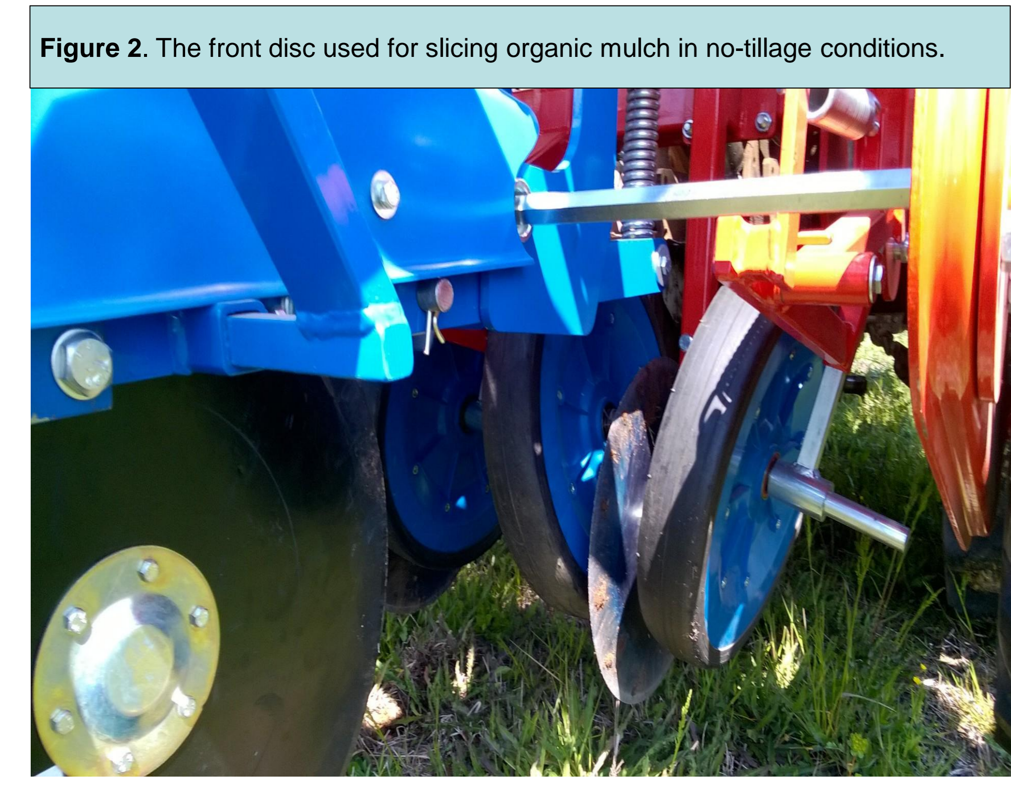
Figure 2. The front disc used for slicing organic mulch in no-tillage conditions.