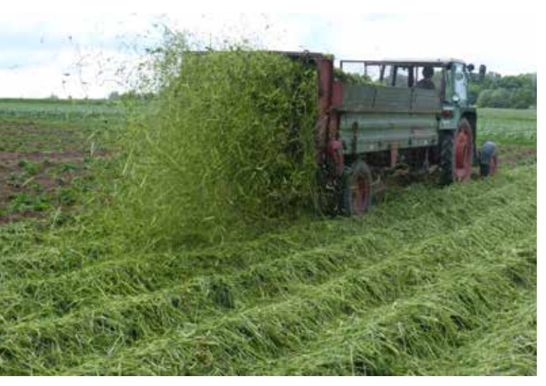
Application of freshly-cut mulch materials in mid-May with a manure spreader to 8-10 cm depth on the potato plots.

The weather conditions in the two years were extremely variable. In 2014, water availability was normal to high in spring, and the summer temperatures were the highest in more than 100 years. In 2015, the spring was very cool and dry with extreme drought in May, followed by normal summer temperatures. This affected the potatoes very differently. In 2014, mulched potatoes were