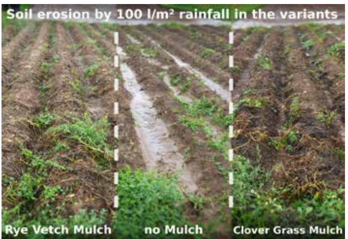
Effects of mulching on late season erosion after defoliation in August 2015.

In 2015, there was no late blight at all due to the drought. In early August the plants were topped to prevent excessive starch formation and to prepare for harvest. Mulch greatly reduced weed problems at that stage. In addition, mulch also prevented heavy erosion due to a strong but not extreme rainfall event, when more than 100mm of rain fell in one and a half days.