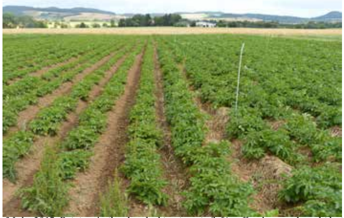
8 July, 2015: Potatoes in the ploughed treatments (left) suffered severe drought but not in the minimum tilled and mulched treatments.