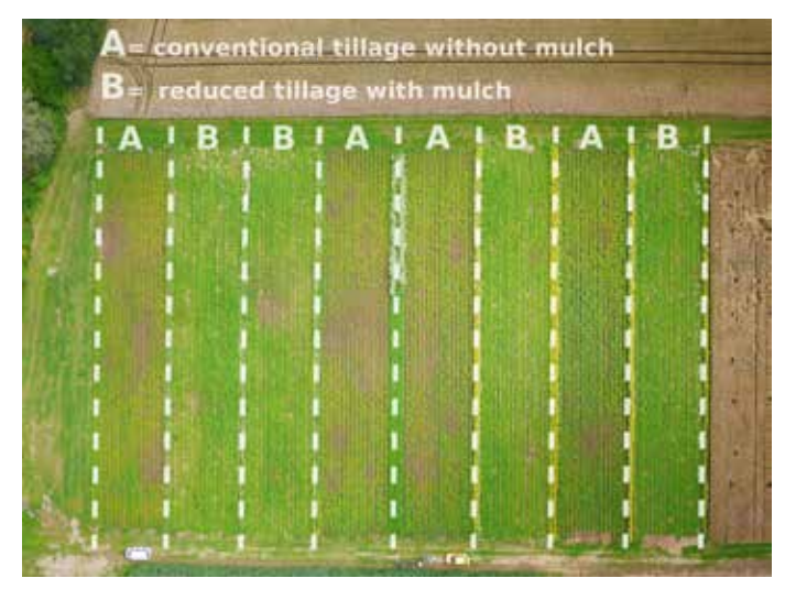
Aerial photo of the plots July 14 2014 during the late blight epidemic.

In 2014, we had a 'normal' late blight epidemic starting in early July. Spread of blight across the mulched treatments was slower by about two weeks, and cumulative disease as expressed in the area under the disease progress curve (AUDPC) was 880 under mulch and 1330 in the ploughed plots (Hohls et al. 2015). The most likely explanation for the reduction of late blight in the mulched plots is that overall the temperatures in the canopy are higher during the day due to the reflection of light by the dried mulch, resulting in a non-conducive microclimate for germination of the late blight sporangia. We could feel the differences in temperature in the field and have measured these in other experiments before, but not in these experiments.