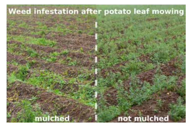
Effects of mulching on weed infestation in early August 2015.