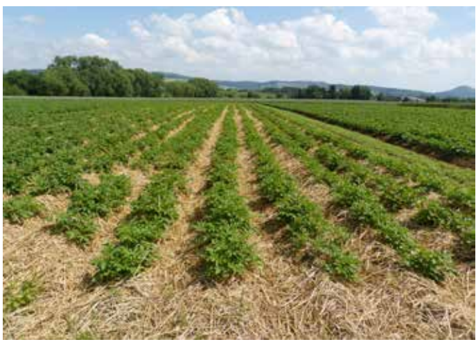
June 6, 2014: the mulched potatoes in the foreground are less lush and green than the ploughed potatoes in the background.