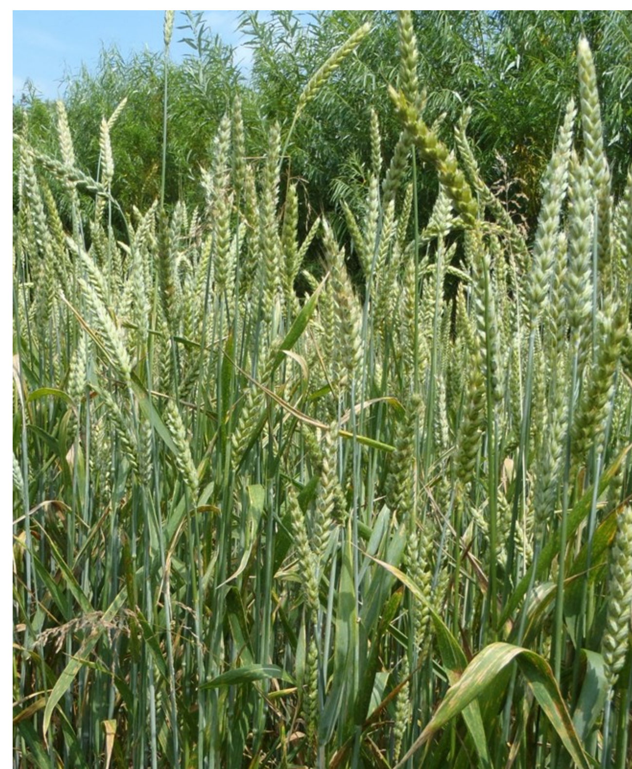
Figure 2. The resulting crop of diverse ORC YQCCP grown at the organic site.