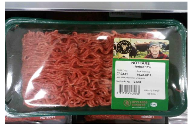
Upplandsbondens package labelling.

The cooperative was selected for study because (1) while the organic food market is growing in Sweden, mid-scale initiatives such as UB are still