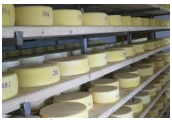
Ripening cellar of Planika dairy located in west-north part of Slovenia.

The company currently sells 19 different milk products under the Planika brand. These high-