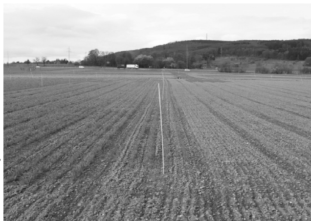
Figure 1. Left: Winter survival of the parental varieties in 2012. Right: Photograph of the populations on the left side of the field and the parental varieties on the right side on April 16 2012. The surviving plot of Monopol is pointed out.

Overall, the differences among the populations in N-uptake were small. There were no statistically significant differences between the conventionally (C) and organically (O) grown populations. However, in both years at flowering the O-populations had taken up approximately 6% more N than the C-populations. These differences were not visible in early cut samples or in seeds and straw. In contrast, grain N contents of Q populations were in both years significantly higher than in the Y populations (Table 1). Thus, the genetic differences for quality were well conserved into the F11.