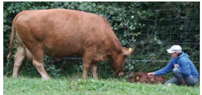
TTouch® is a method based on 1 ¼ circular movements of the fingers and hands all over the body of the animal.

Stress during the animal's lifetime and before slaughter can be reduced by better human-animal-relationships arising from a positive handling method. Established in a preliminary study (Master Thesis) with handling five weeks before slaughter.