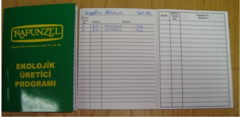
Farmer documentation book