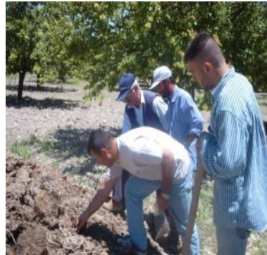
Inspection of the organic controle at thr farmer