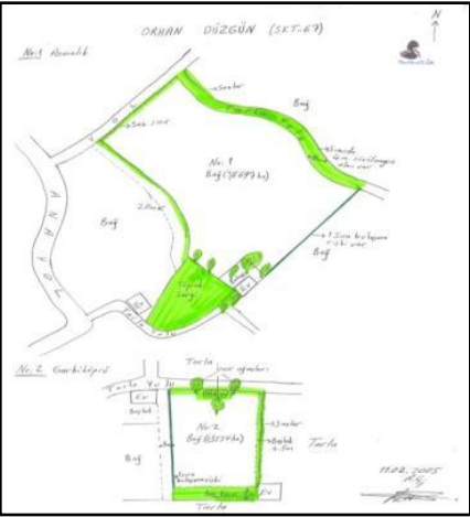
Plan of the fields