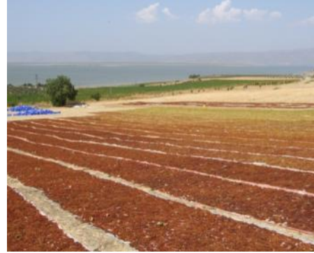
Harvest and drying