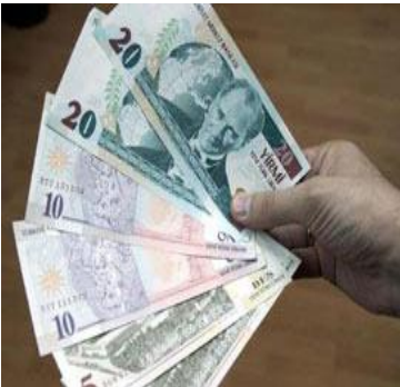
Paying of the farmer