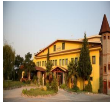
Inspection of the production unit