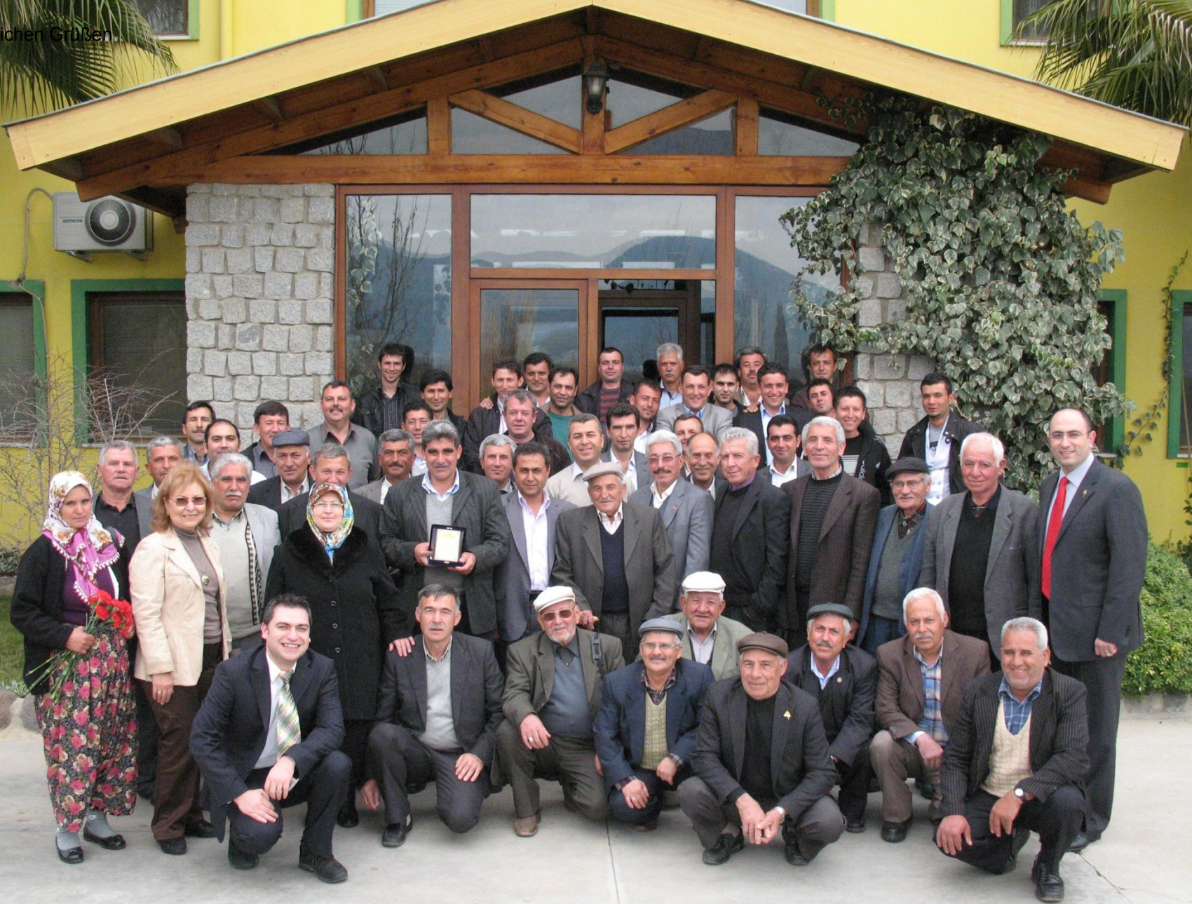
Farmer meeting in Ören