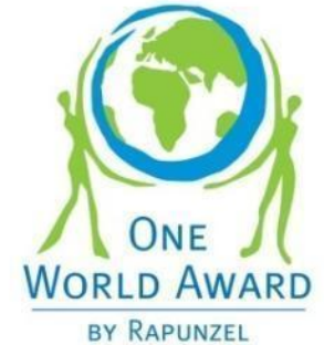
Dr. Klaus Töpfer