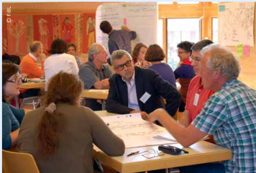
Project partners of the SOLINSA project at a meeting, reflecting and developing new ideas in small groups, using various methods of visualisation and facilitation.

Process management conceives a project as a process in which a group of people sets out to reach a common goal. While in-