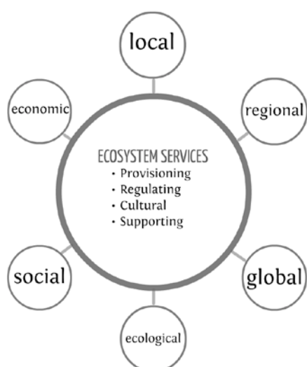
Figure 1: Ecosystem services, including their spatial scales and agro-ecosystem impact indicators (illustration: Pohl)

The filtering, buffering, and transformation function of soils (Figure 2; Blum, 1998) regulates and supports ecosystem services like nitrogen fixation, erosion control, soil conservation, soil formation and nutrient cycling.