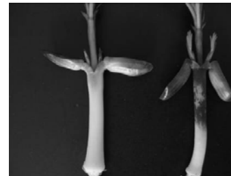
"A" stage "n" stage "M" stage

Fig. 1. The peanut AnM cultivation (left) and color changes (right) after hypocotyl exposing.