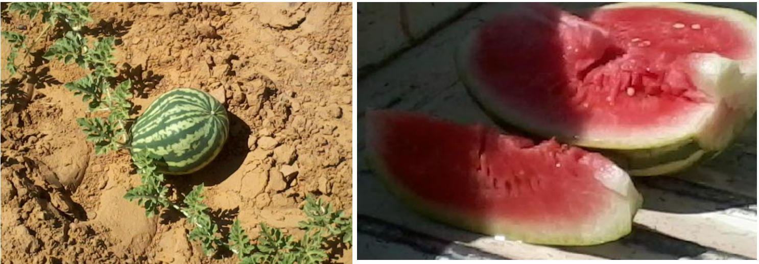
Figure 2: Watermelon produced organically by default (not certified) at Wadi-Almogadam valley 135 km west Khartoum