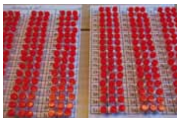
Fig. 1 Preparation of double-blinded samples for the triangle tests in a balanced serving plan.

There is a need of scientific evidence on the differentiation of organic from conventional produce concerning health, nutrition and sensory related qualities (Leifert et al., 2007). Analysis of wheat from the DOK long-term system comparison trial near Basel, Switzerland (Mäder et al., 2002) showed that organic wheat differed in contents of 16 “diagnostic” proteins from conventional wheat (Zörb et al., 2009a), had higher concentrations of K + and Mg 2+ cations and lower concentrations of six amino acids, and a different seed ripening metabolism (Zörb et al., 2009b). In a previous sensory test with cooked porridge of wheat (cv. Tamaro) from the DOK trial (harvest 1999), the biodynamic samples had been preferred (Arncken et al., 2007). In the present work we aimed to corroborate these results with dry samples of three harvest years.