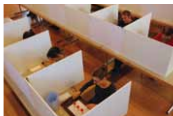
Fig. 2 Triangle tests in individual, mobile sensory booths at FiBL.