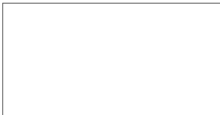
Figure 6: Do you find the information provided by the portal relevant?

During the phase of the collection and harvesting of the resources for the Organic.Edunet Web portal, a lot of effort was put in the selection of the appropriate educational material in terms of relevancy with the topics of OA and AE. However, according to the results of the survey, about 3,75% of the users still considered the portal information to be irrelevant to the topics of OA & AE.