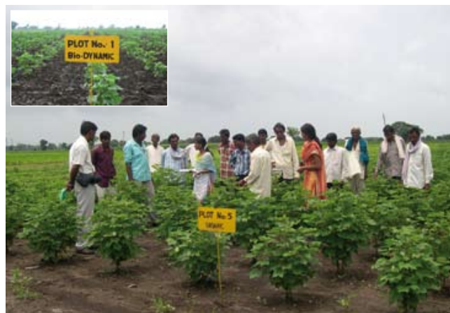
Farmers are highly interested in the trial. About 15 farmers' groups visited the field in the first cotton season. Insert: the cotton crop one month after sowing.