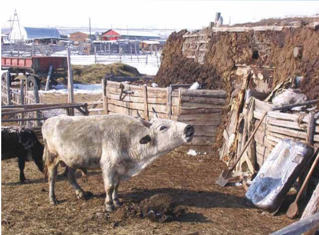
Figure 2. The bull in the state farm is nervous because two new bulls arrived in the cowshed last night. The rotation of bulls between the three villages (Dzhargalakh, Kustur and Batagay-Alyta) was launched after a ten year break.

The book can be ordered - see bibliography section of this newsletter