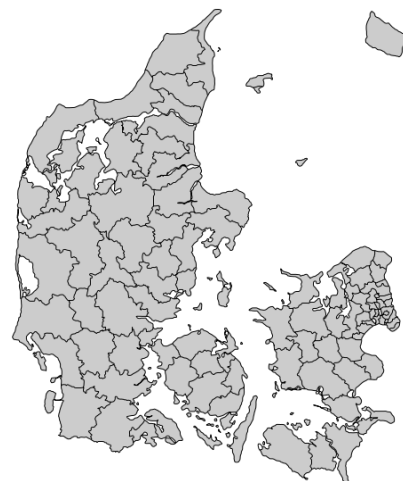
Figure 1. The 98 municipalities in Denmark.

Denmark is divided into five regions and 98 municipalities (Danish: ”kommuner”). This structure was established in the administrative municipality-reform, which became effective on January 1, 2007. This reform replaced the 13 counties (Danish: amter) with the five current regions. The former 270 municipalities were consolidated into 98 larger units, most of which have at least 20,000 inhabitants. The reason was to give the new municipalities greater financial and professional sustainability. Many of the responsibilities of the former counties were taken over by the enlarged municipalities. Included in this is the responsibility for health promotion, which has motivated many municipalities to make their own health policy. In some municipalities the school food is included as a part of this policy towards healthier citizens.