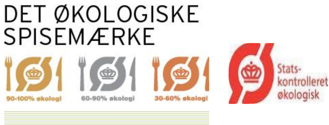
Figure 2. The Danish labeling system for food serving, building on the Danish national organic label, which is a red “Ø”. In Danish, organic is “Økologisk”.

In January 2009 a new organic state controlled label system for large scale kitchens called “spisemærket” (The Eating Label) where introduced. The label symbol is the same as the “Ø-mærke” (the official Danish label for organic certification), and comes in three colors: Bronze, silver and gold. Each colour represents the use of a different amount of organic ingredients (in weight or cost).