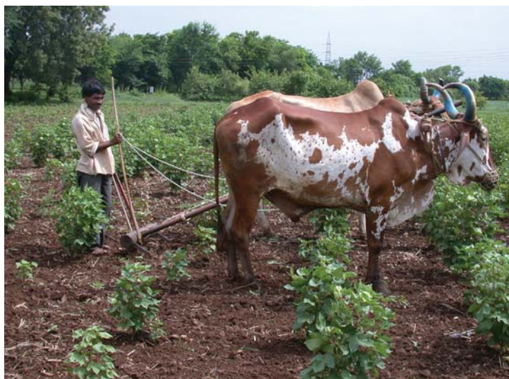
Soil cultivation eliminates weeds and helps to keep the precious moisture in the soil.

The experience of "Maikaal", India, suggests that cotton production can be done in a socially, ecologically and economically sustainable way. An increasing number of farmers of the region are getting engaged in organic farming methods, and many are adapting the promoted low cost drip irrigation systems. At the same time, a number of questions arise which are to be answered before the Maikaal approach can be promoted as a model for replication.