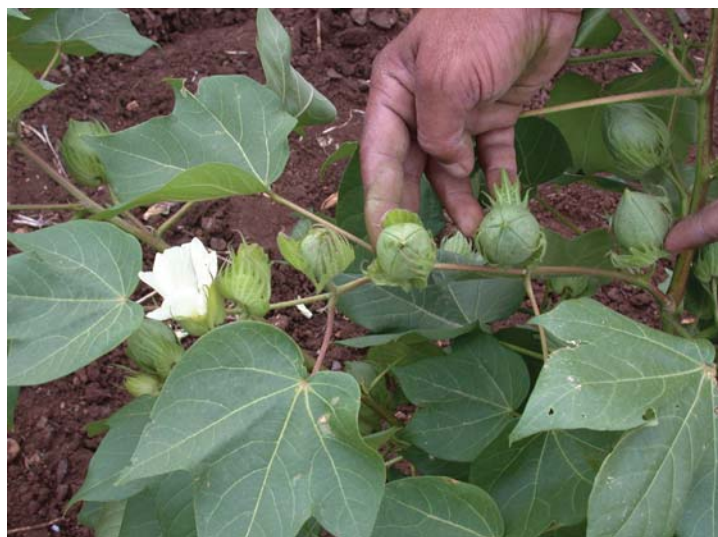
Flowers and forming pods at an organic cotton plant.