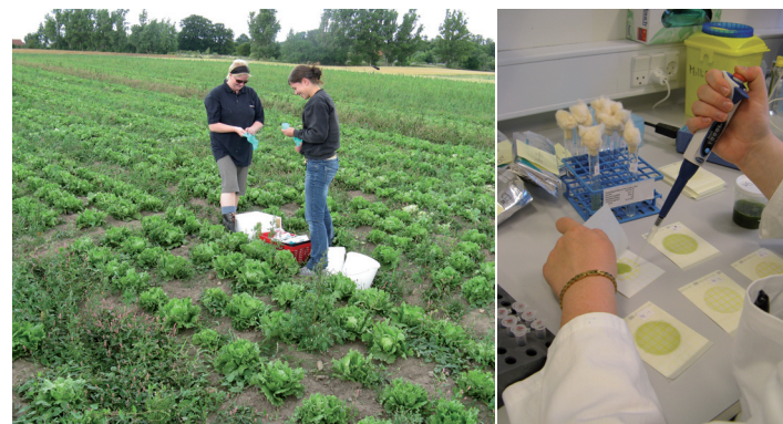
Figure 2. Sampling of lettuce plants for subsequent screening for the prevalence of human pathogens.

Part 1b shows the percentage of samples from the individual countries that proved positive for the respective pathogens.