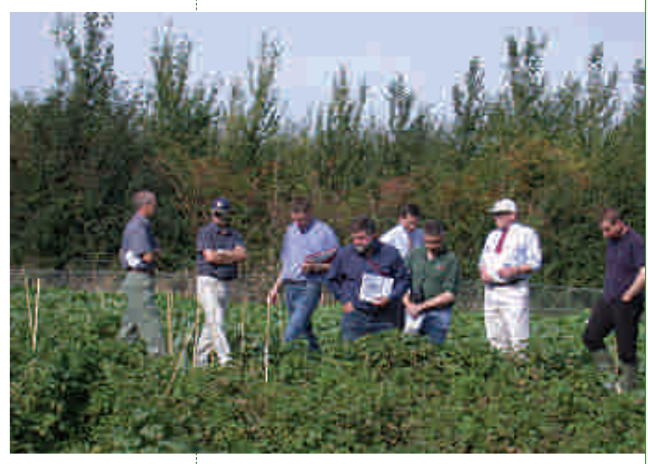
Open day at Sarpo trials at Henfaes

For more details of research carried out by IRS, OCW partners and a wide range of other organisations go to www.organic.aber.ac.uk/research.