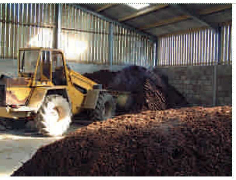
ADAS woodchip trials

A project that links a number of important topic areas has been the evaluation of woodchip for livestock bedding and its subsequent composting carried out by ADAS at Pwllpeiran. This has now moved to a second phase where the resulting compost is being evaluated for the production