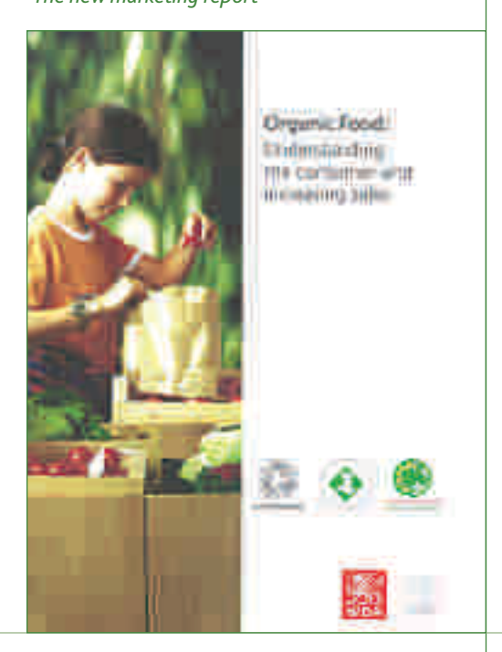
The new marketing report

This 'toolbox' approach is being taken in other areas where the Group consider that Welsh organic businesses need assistance. The next task is however to go back to the grassroots and understand from the participants in the industry what tools they need to better market Welsh organic products in an increasingly competitive marketplace. From this exercise, priorities can be given to the most pressing requirements for 'tools' to enable Welsh organic companies to stay at the forefront of organic developments in the UK.