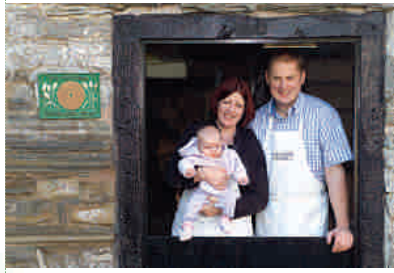
The Scotts of Bacheldre

The True Taste Food and Drink Awards,<sup>5</sup> now in their third year, celebrate and recognise the very best of food and drink in Wales. Winners have the opportunity to show-off their produce to a high-profile judging panel, which includes chefs, food writers and supermarket buyers. They also benefit from an UK-wide public relations campaign and are guaranteed coverage on ITV Wales Food Show.